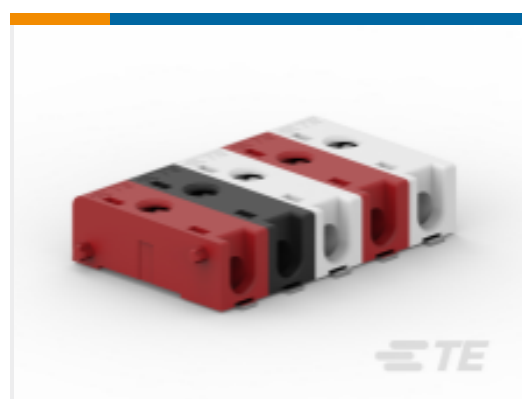
TE Part # CAT-B8519-P7565 Poke-In Connector, BUCHANAN WireMate