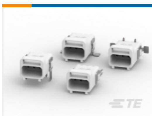
TE Part # CAT-SL36-M6642B SLIMSEAL MINIATURE HEADERS