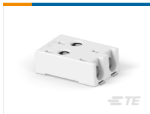
TE Part # 2834385-2 RELEASE POKE-IN CONNECTOR_2P_NATURAL