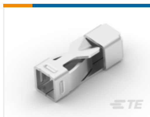
TE Part # 2834167-3 RELEASABLE SLIM CONTACT